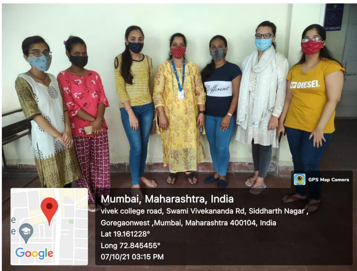
Students participated in Certificate Course on 'Gender Studies'